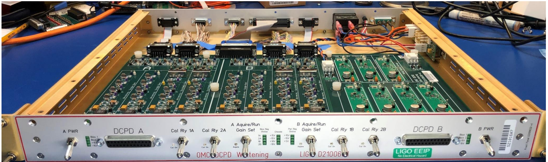
Figure 1: Front