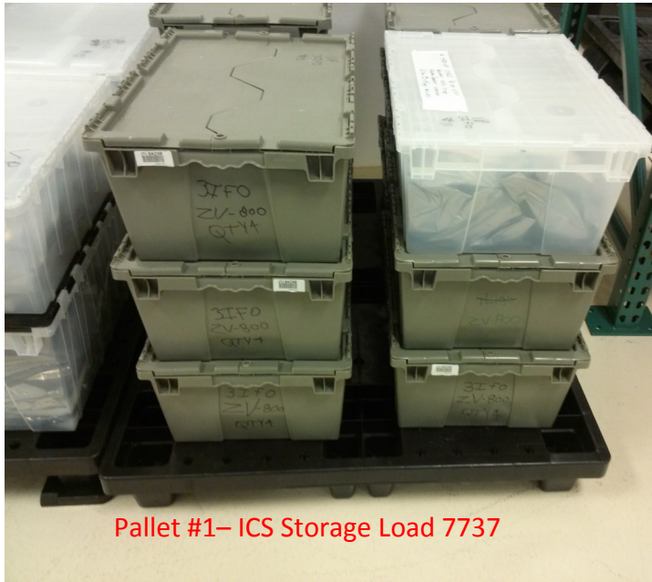
Pallet #1- ICS Storage Load 7737