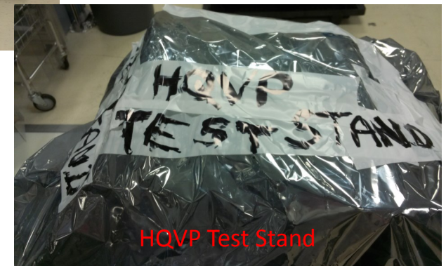
HQVP Test Stand

Bar codes and labels still need to be made. VP Guards etc in various ICS loads and stored at YMid. That info will be married to this information ASAP. JLF