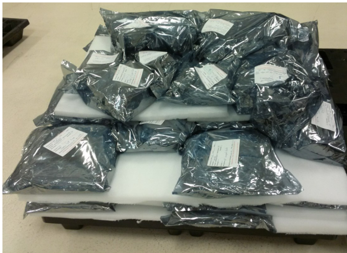
Pallet #3-ICS Storage Load 7738