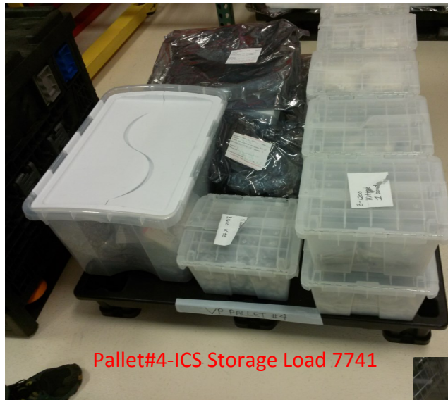
Pallet#4-ICS Storage Load 7741