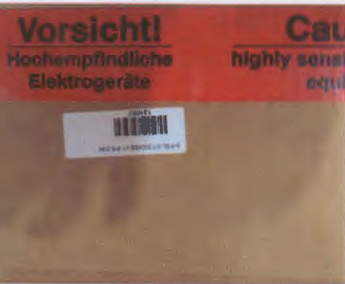
Thermo Electric Cooler x 1 TEC1