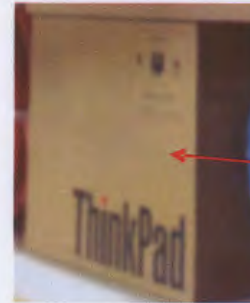
PC x 1