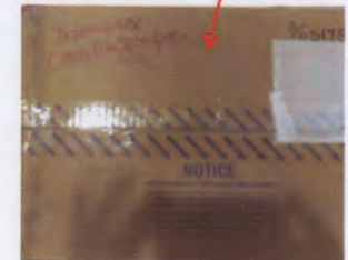
Tektronix Oscilloscope x 1