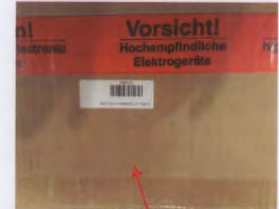
Thermo Electric Cooler x 1 TEC2