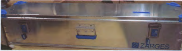
Faraday Isolator in sealed aluminum case