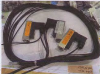
Flow Sensor x 3

water stuff: 5x PLCD200-M8 3x float flow meter 6x PLCD130-M8 6x #138ES NPT 10x 200 mm 75 x 138ES