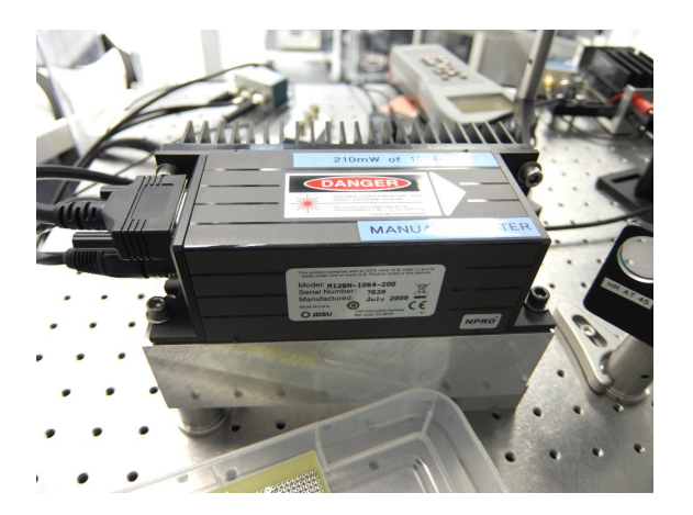
Figure 1: The Lightwave 126 laser head set up in the LLO optics lab.

can be found in the manual which is available online at the JDSU website (they purchased Lightwave), but the key parameters are listed in table 2.