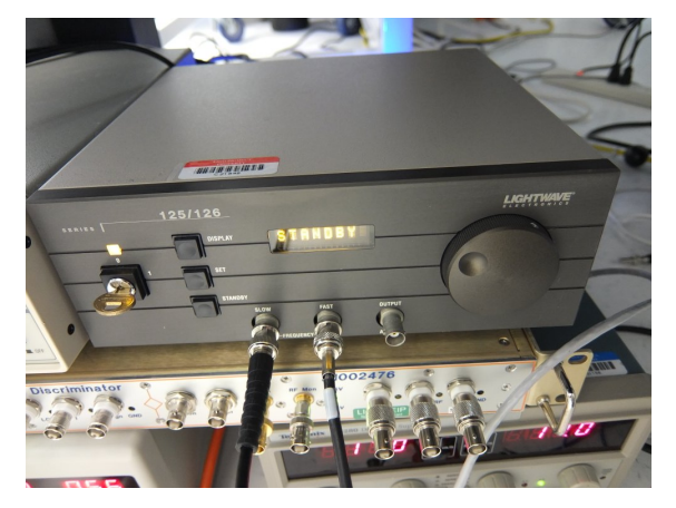
Figure 2: The Lightwave 126 power supply and controller.