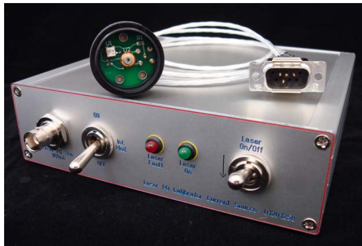
Figure 1, front panel and calibrator head