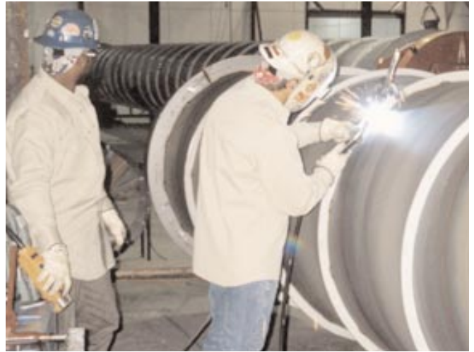
Figure 2 - Stiffener Welding