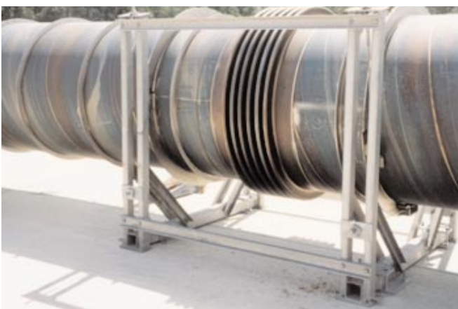
Figure 11 - Guided Support