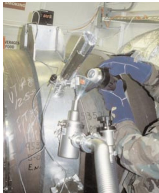
Figure 10 - Circumferential Leak Testing