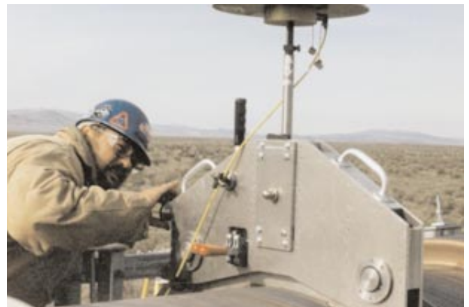
Figure 12 - GPS Alignment