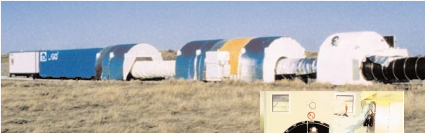
Figure 7 - Clean Room, Weld Shelter and Test Shelter