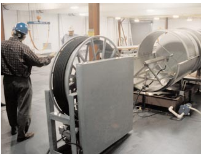
Figure 5 - Section Cleaning