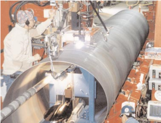
Figure 1 - Spiral Tube Mill