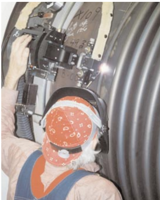
Figure 9 - Circumferential Seam Welding