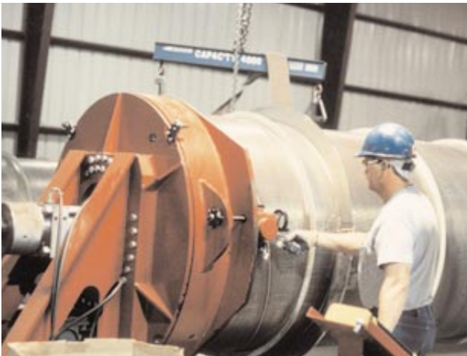
Figure 3 - Machining Tube Ends