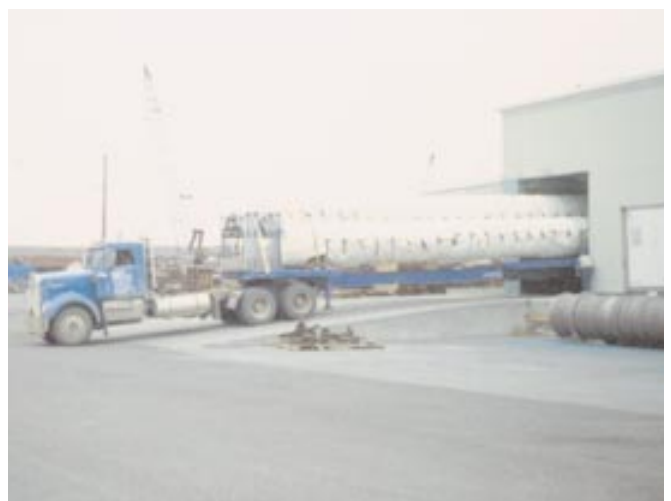
Figure 6 - Transportation to Site