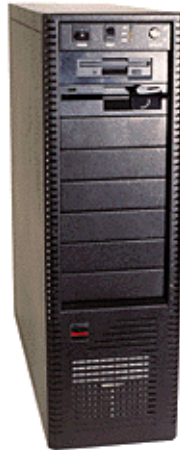
FIGURE 1. Microway Alpha based “Screamer” Workstation

The workstation was purchased in Spring of 1998 and consisted of an Alpha LX motherboard (see Figure 2 below) with a 600 MHz Alpha CPU, a 4MB 9ns SRAM cache ( the largest available on the market at that time and capable of going up to 8MB ), 128 MB of dynamic RAM and a 4 GB ultra wide SCSI hard drive. The unit was shipped with a modified version of the Redhat Linux 5.0 operating system. The motherboard also includes 32 and 64 bit PCI bus interface. The workstation includes a standard DEC keyboard and a Iiyama 17 inch monitor and a three button Logitech mouse.