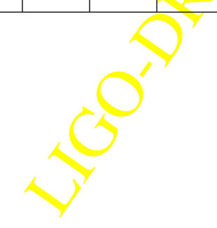
Table 8: Quality Conformance Inspections