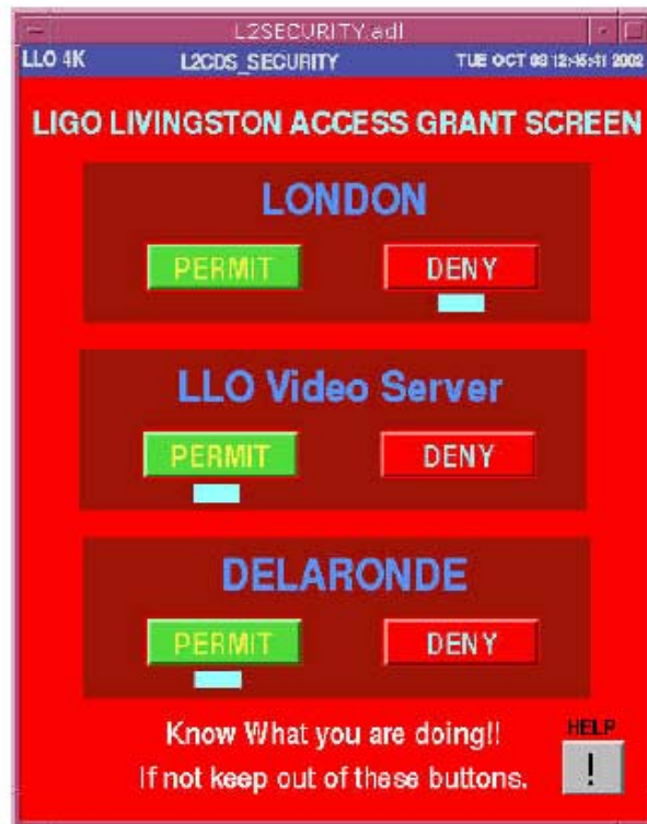
Figure 4: Epics access security screen at LLO

The security medm screen available to the control room operators is shown in figure 4. The LLO video server has to be permitted by the control room operator for it to work. These buttons are restricted to be set only on the operator machines in the control room by the security file.