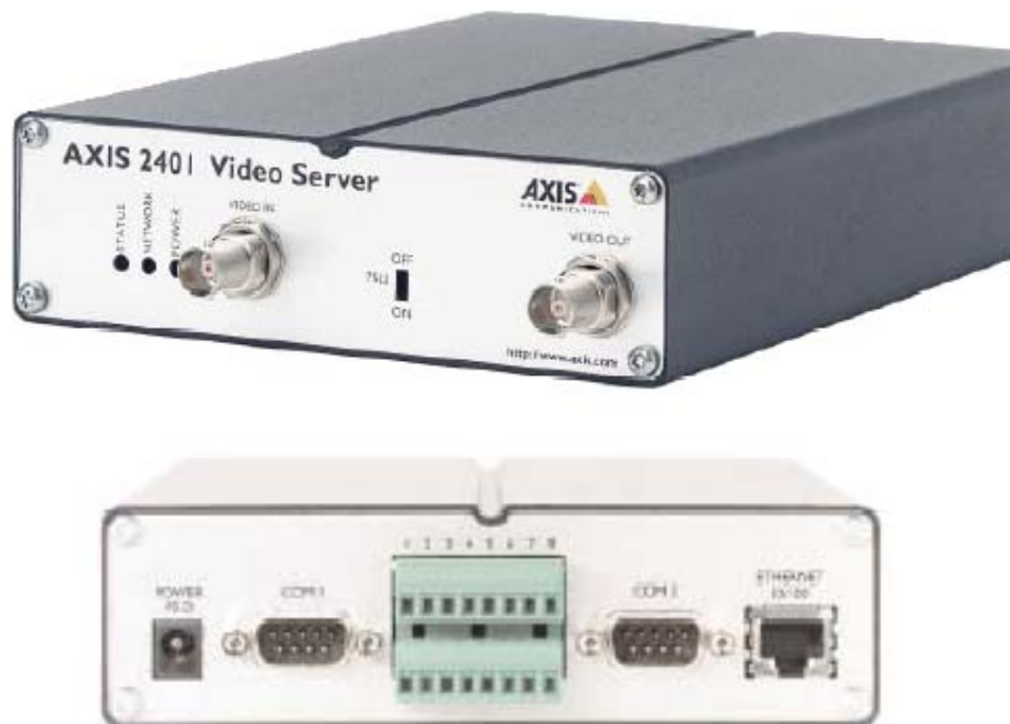
Figure 1: AXIS 2401 Video Server – Front (Top) and Back (Bottom) View

The hardware is the commercial off the shelf (COTS) AXIS 2401 video server manufactured by AXIS Communications ( www.axis.com ). This video server accepts a video input and has a built in server which broadcasts the image over the Ethernet network. Figure 1 shows the picture of AXIS 2401 video server.