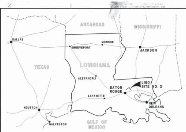
SITE NO. 2 LIVINGSTON, LOUISIANA