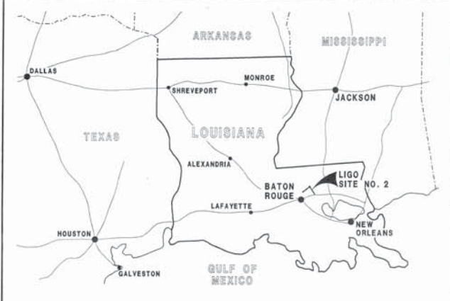
SITE NO. 2 LIVINGSTON, LOUISIANA