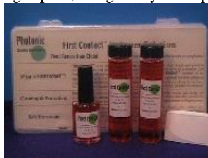
Figure 4: Small FC applicator bottle and two refill bottles.