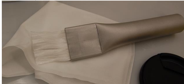
Figure 1: 1'' aluminum handled nylon brush from Gordon Brush.