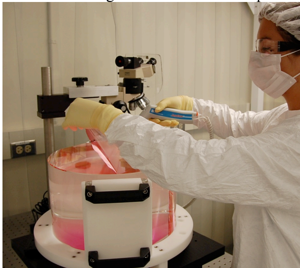
Figure 6: Removing film from test mass.