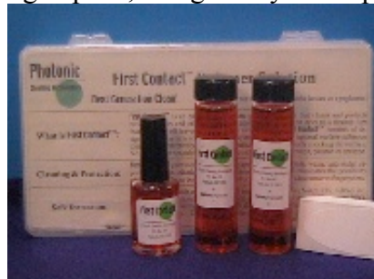
Figure 4: Small FC applicator bottle and two refill bottles.