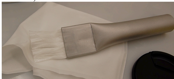
Figure 1: 1'' aluminum handled nylon brush from Gordon Brush.