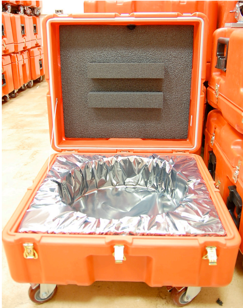
Figure 2: Make sure top handles fit the top two rectangles of foam shown here