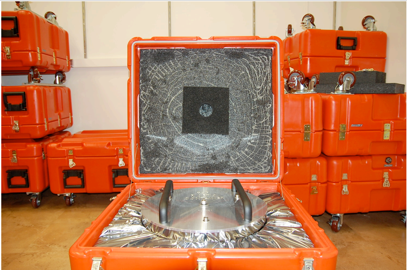
Figure 3: Shipping case for R optic container, handles may be in any orientation to fit the foam square