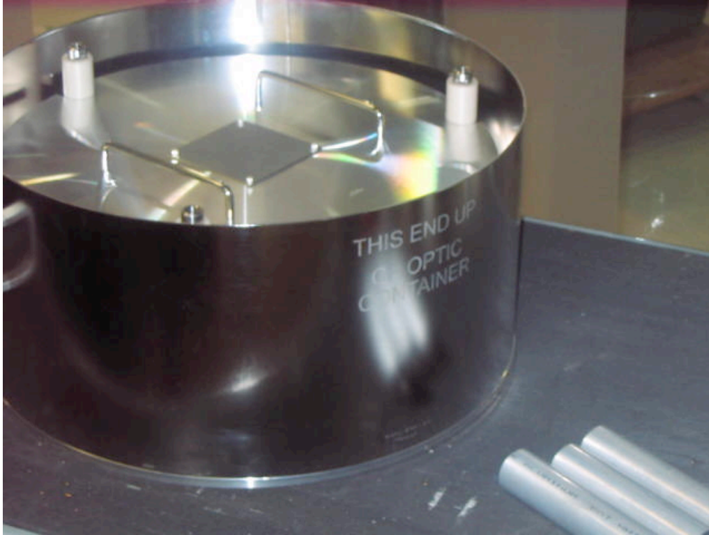
Figure 6: CP optic container with wedge plate and outer sleeve in place, top cover removed. The hollow aluminum rods at the bottom right are the shipping sleeves, to be put in place over the 3 teflon sleeves when the optic container is shipped without an optic.