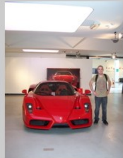
Fast cars are a speciality in Italy