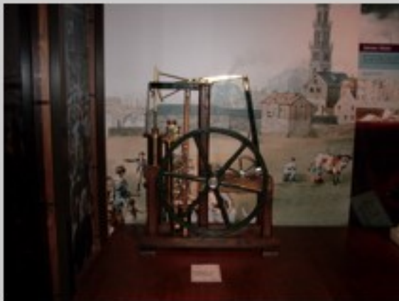
James Watt's personal steam engine in Glasgow