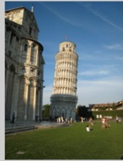
Gravity at work in nearby Pisa