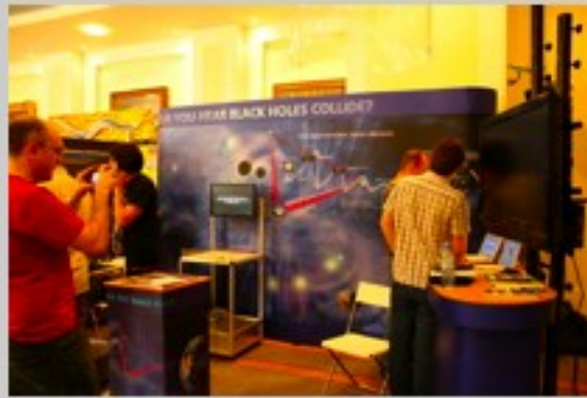
Cardiff sent an exhibit to the Royal Society Summer Exhibition