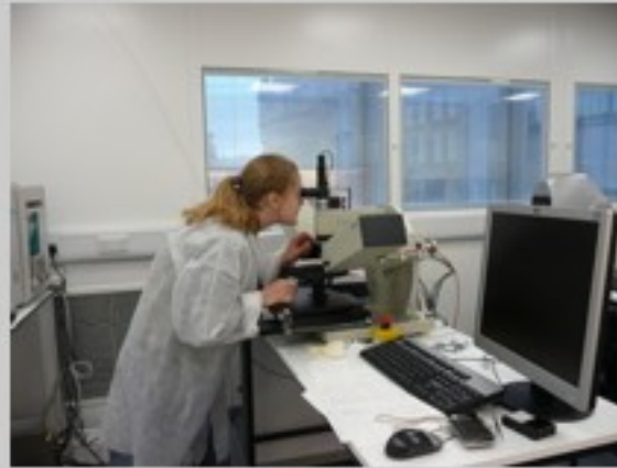
Working with the ellipsometer - time off from sightseeing